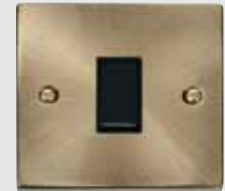
011 (025 intermediate)

Modular Ingot Plate Switches Dimmer Switches | Toggle Switches